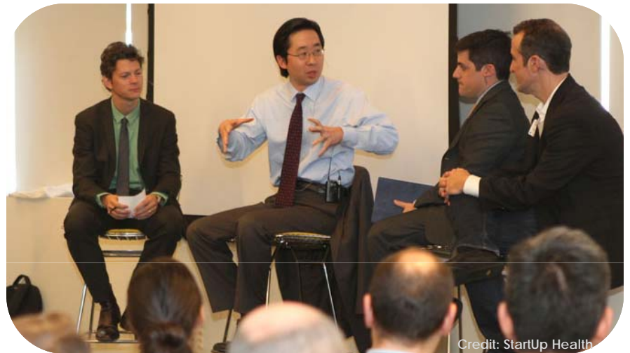
➤ Comparative Effectiveness Public Advisory Council (CEPAC)