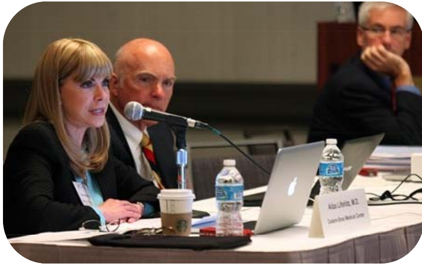
← California Technology Assessment Forum (CTAF)