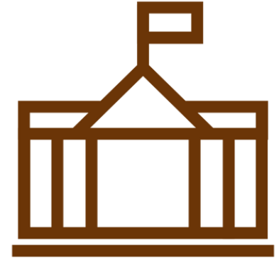
Federal Nutrition Programs