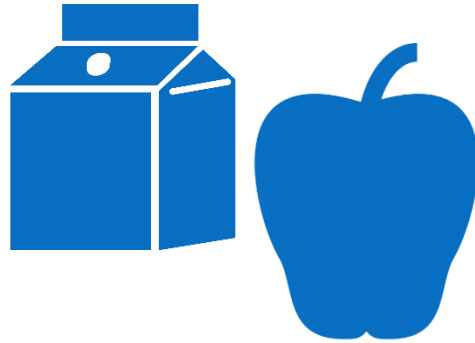
Early Childhood Education Settings